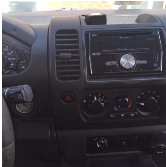
5. Unit mounted above radio with OBD extension cable tucked behind dashboard