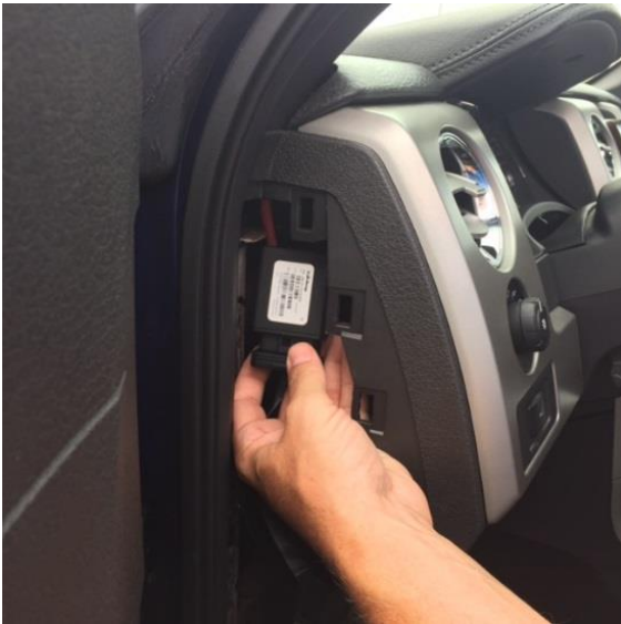
4. Unit with OBD extension cable tucked completely behind the dashboard