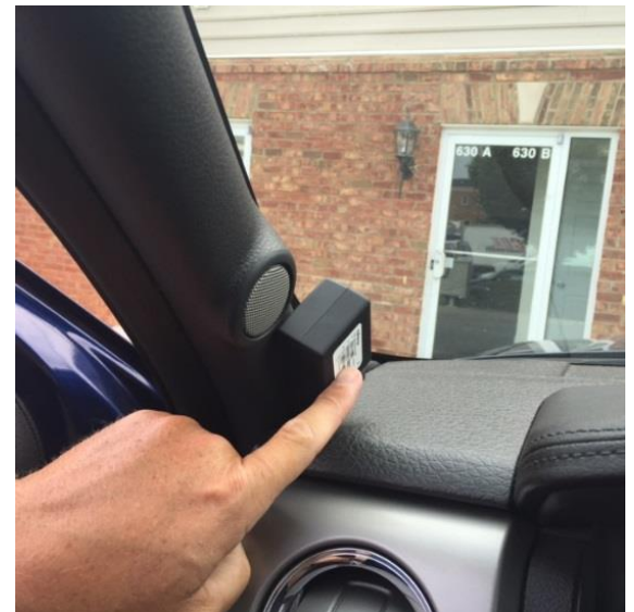
6. Unit mounted on A-pillar using provided 3M tape with OBD extension cable tucked behind dashboard