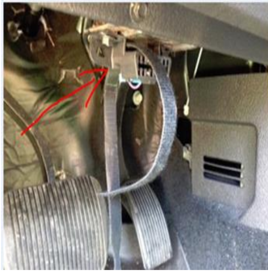
2. Strap installation part 1