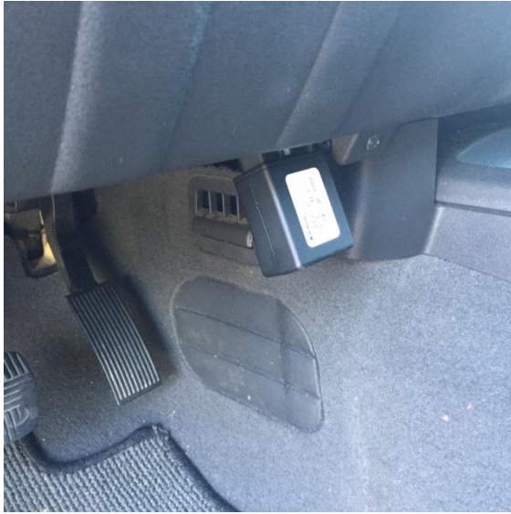
1. ODB installation without strap