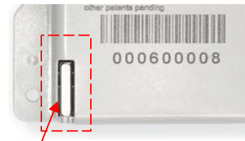
Magnet located on the lower left corner of the SkyHawk II

DO NOT paint the surface of the SkyHawk II as it will degrade the performance of the unit.